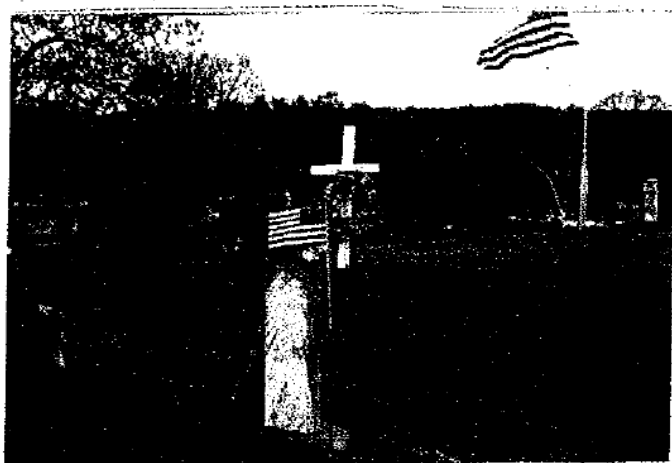
REMEMBER OUR VETERANS