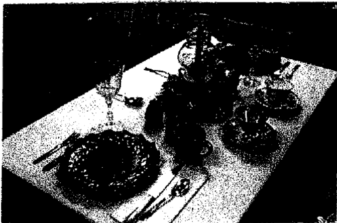
Our Christmas Table Display